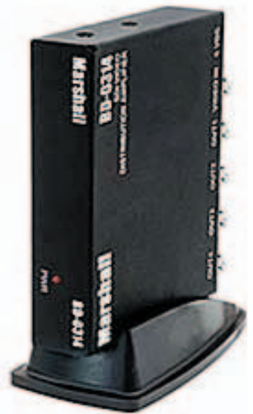
on V-CB1 Stand