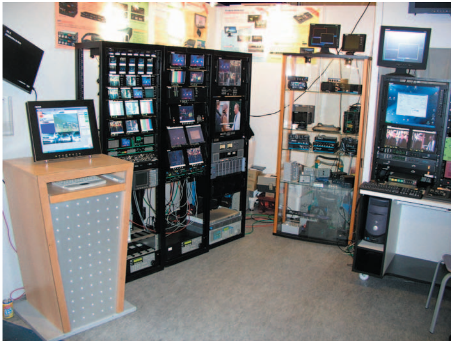
Monitoring Company au SATIS